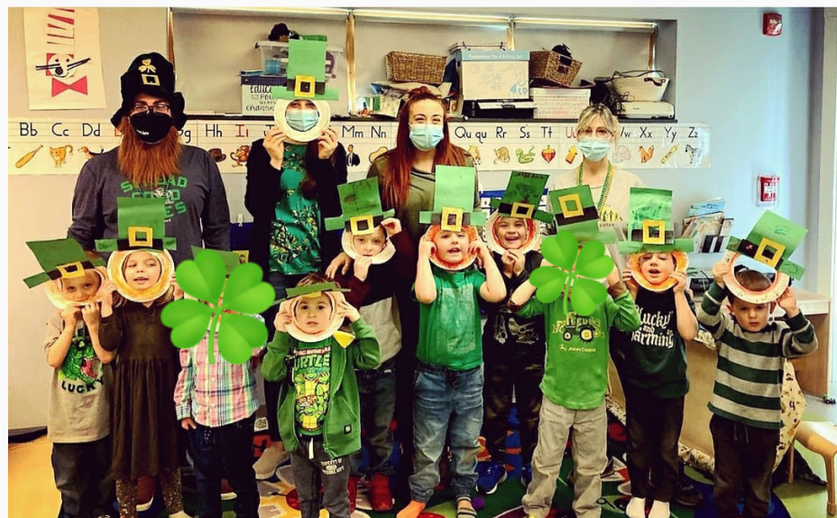
Students Enjoying Earth Day and St. Patrick's Day Celebrations at PlayWorks Child Center