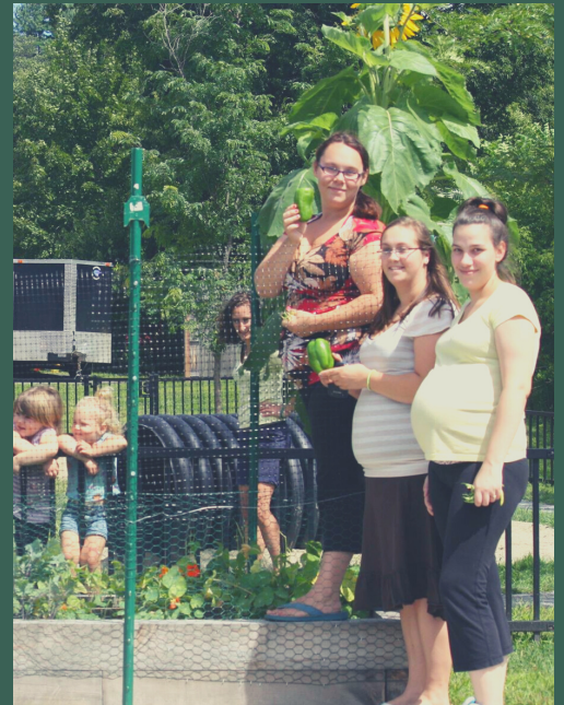
Some of the Learning Together participants harvest from the garden they grew, 2013.

Visit www.sapcc-vt.org and click on our donate button to make a charitable contribution to SAPCC today. SAPCC is a 501(c)3 nonprofit organization and all donations are tax deductible.