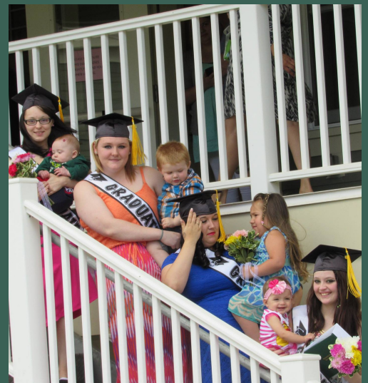
The class of 2016 Learning Together participants celebrate their accomplishments with their children.